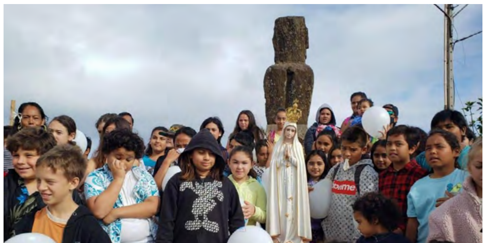
Image of the Pilgrim Virgin welcomed by children on Easter Island, in the middle of the Pacific Ocean.

The Pilgrim Virgin Image of Our Lady of Fatima returned to Fatima on 20 January 2022, two years after its arrival in Chile.