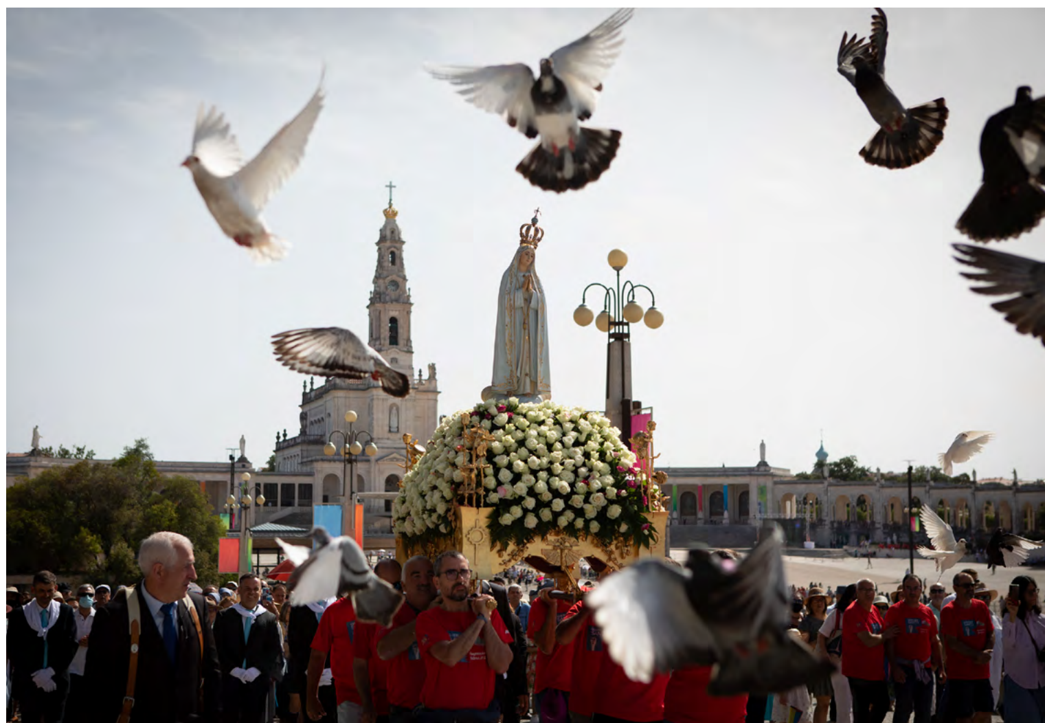
International Anniversary Pilgrimage of June 13, 2022