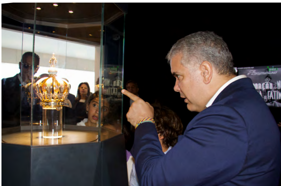
The President of Colombia, Iván Duque Márquez, visiting the temporary exhibition Faces of Fatima.