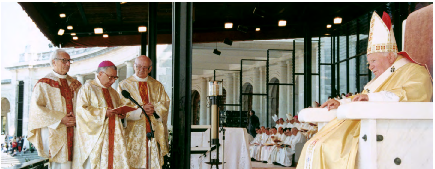
During John Paul II’s last visit to Fatima, in May 2000, the Supreme Pontiff commissioned Angelo Sodano to reveal the third part of the Secret of Fatima. In the photo, the Bishop of Leiria-Fatima asks the Holy Father for the beatification of Francisco and Jacinta Marto.

On May 13, 2000, Sodano – at the request of John Paul II – revealed to the world the third part of the Secret of Fatima.